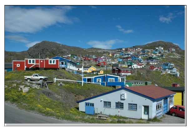
Wig-Wam Accommodation/Jaaraatooq Shop