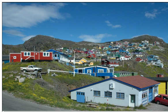
Wig-Wam Accommodation/Jaaraatooq Shop